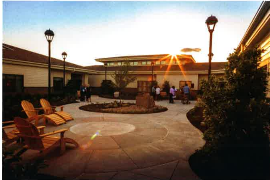
The Residence at Alive Hospice Murfreesboro

Alive Hospice Murfreesboro celebrated the Grand Opening of their 21,300 square foot facility on May 30 and began admitting the first patients in June. They currently have 10 beds with the ability to expand to 16 beds and anticipate serving 200 patients and their families in the first year of operation. Two grief counselors provide bereavement support and event space allows educational programs and grief support groups to meet. The WEHF is proud of our partnership with Alive Hospice over the past five years.