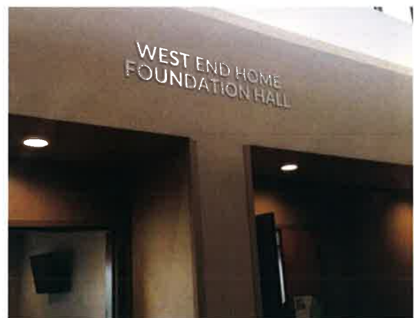
Alive Hospice Murfreesboro West End Home Foundation Hall